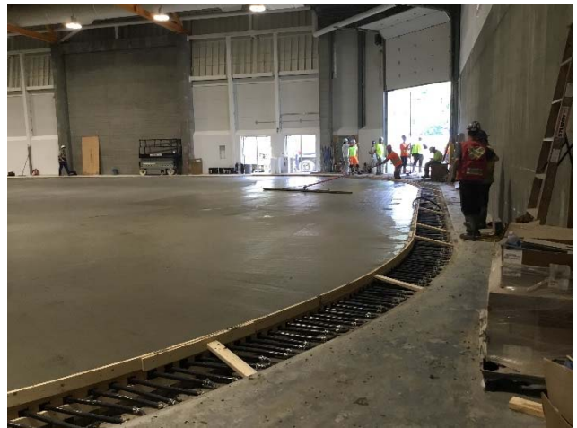
Finishing Touches – Finishing touches are put on the concrete slab.