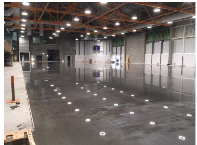
Mirror Image – Concrete slab covered with water with view to the south end.