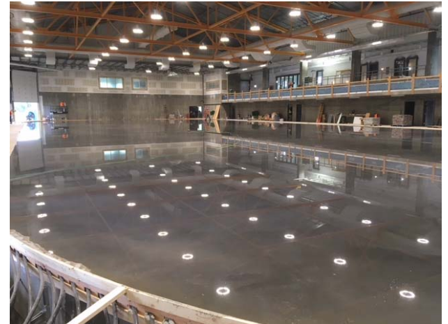
Curing – Concrete slab is covered with a layer of water to help it cure and reduce its temperature.