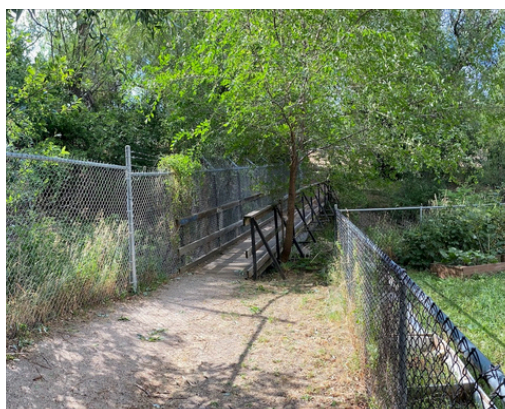
Current outlet crossing at the Vernon Water Reclamation Centre

*Schedules are subject change due to weather and other factors.