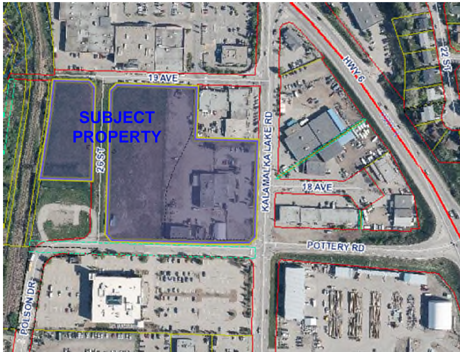
Aerial Photo of Property TUP00018