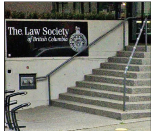
The Law Society of British Columbia is investigating the conduct of the owner of a Vernon law firm. (File photo)