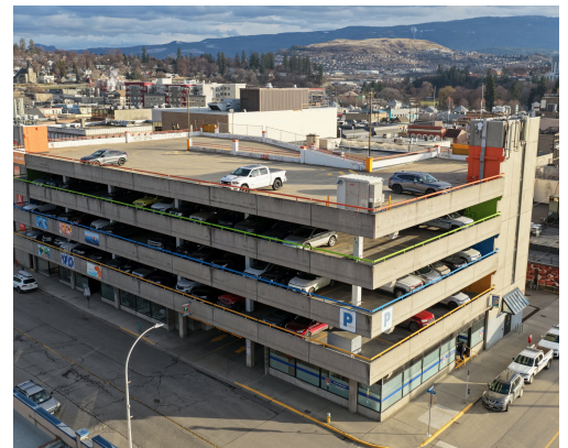
Waterproofing and stairwell repair at the Parkade

We're focusing on renewing and maintaining key facility components to improve the reliability and sustainability of the Parkade.