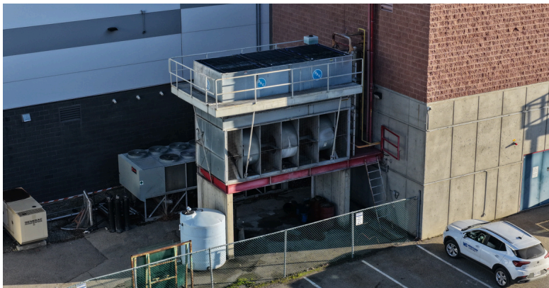
Current condenser unit at end of life

*Schedules are subject change due to weather and other factors.