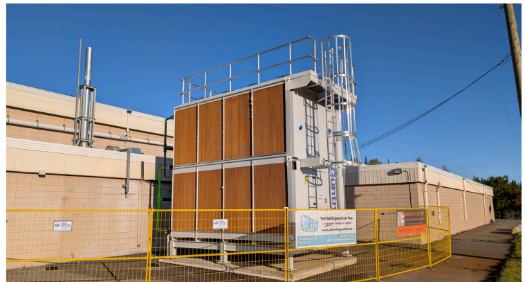
Example of replacement unit

We're focusing on renewing and maintaining key facility components at Kal Tire Place to keep the facility safe, reliable, and fully operational.