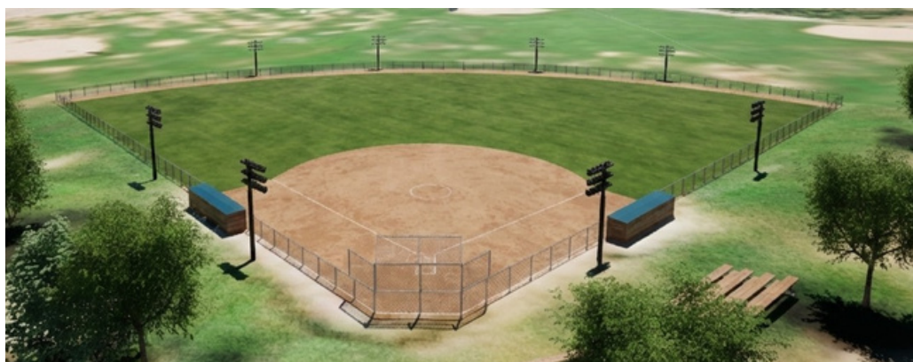
Concept of new field lighting and turf enhancements

*Schedules are subject change due to weather, contractor timelines and other factors.