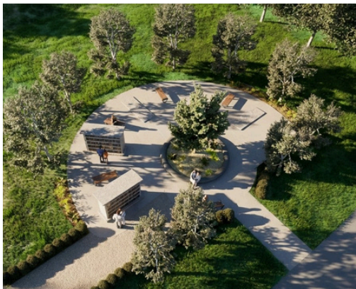
Concept of Phase One

*Schedules are subject change due to weather, contractor timelines and other factors.