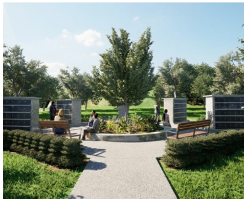
Future phases of the project showing the completed concept