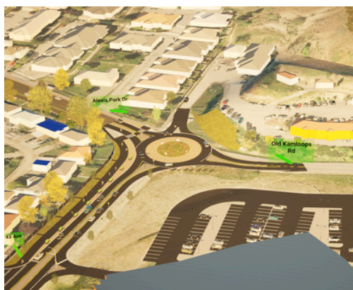
Concept of roundabout and entrance view