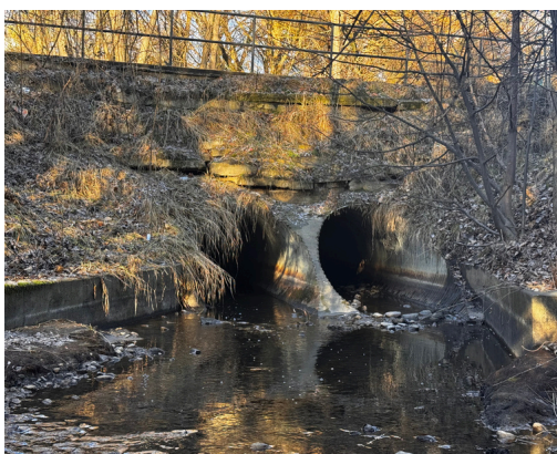
Images of the current creek crossing

*Schedules are subject change due to weather, contractor timelines and other factors.