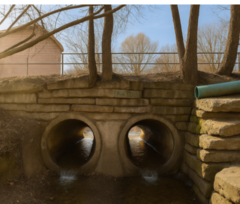
Concept of crossing rehabilitation

As rainfall events become more frequent and intense, maintaining reliable drainage infrastructure is essential.