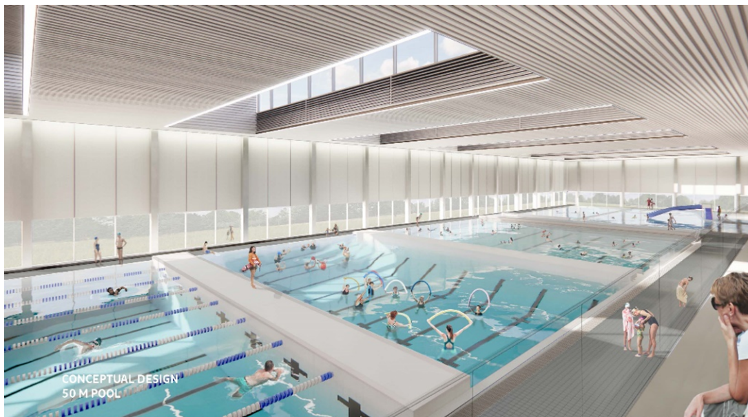
Photo above: A conceptual drawing of the 50m pool with two bulkheads moved to create three separate programmable areas.

If electors vote in favour of the referendum question, an additional 25m of indoor water would become available in the community by Fall 2026, offering the ability to have more swim lesson capacity and multiple programs happening at the same time throughout the day (such as Learn to Swim programs and public swimming), rather than having to choose to offer just one at a time. This is because of the double bulkhead design of the 50m pool, which would allow for various configurations of the pool, such as 2 x 25m swim areas or 3 programmable sections.