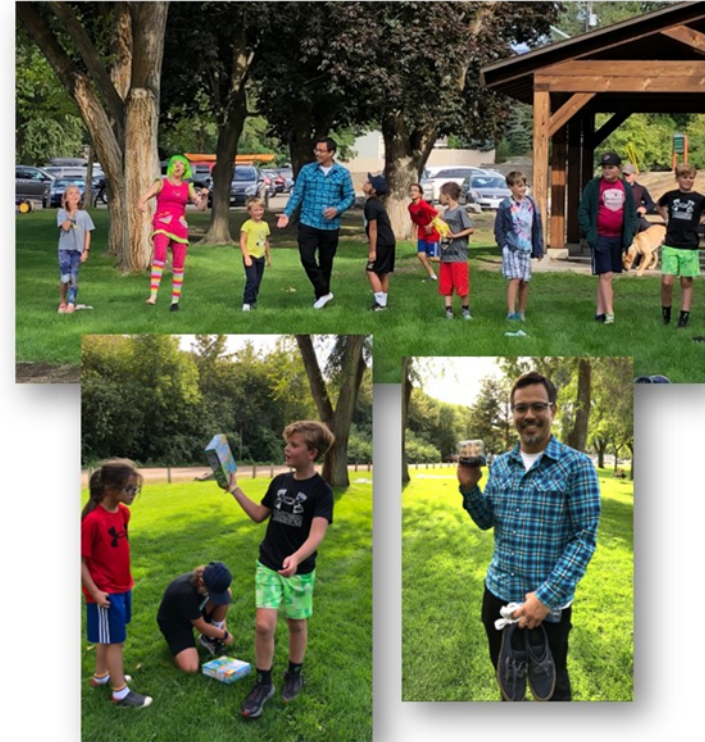
MSA Family BBQ - 2022

Comprised of facility based physicians at VJH. Member dues support local charities, provide high school scholarships and pay for physician events.