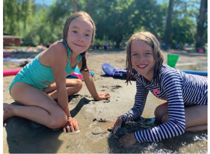
These camps are based from Lakers Clubhouse, 7000 Cummins Road Swimming at Kin Beach and/or Paddlewheel Beach included.